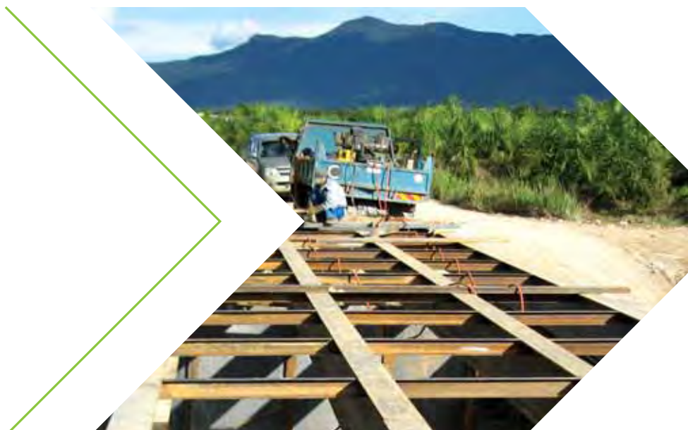
Bridge over Sanjau River in our Sungai Tenggang estate under construction